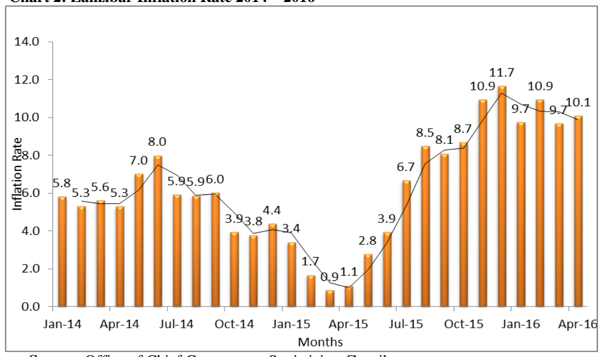
Chart 2: Zanzibar Inflation Rate 2014 – 2016